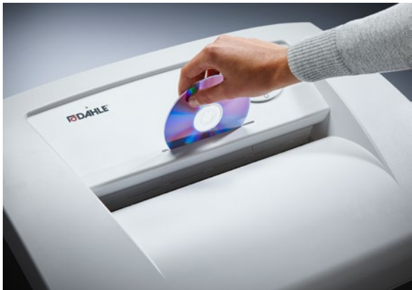
Separate CD feed opening with dedicated collection bin for environmentally friendly waste separation and secure destruction