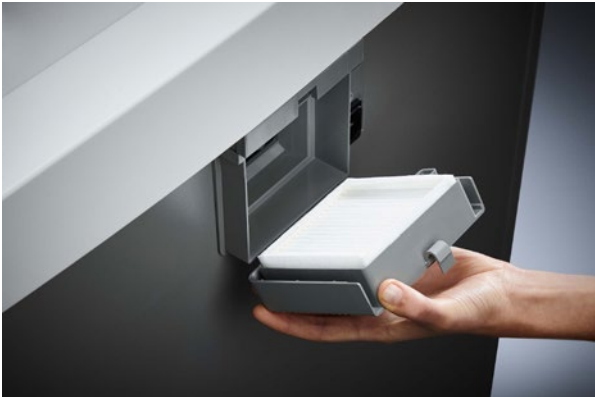
Dahle Waste 206air document shredder