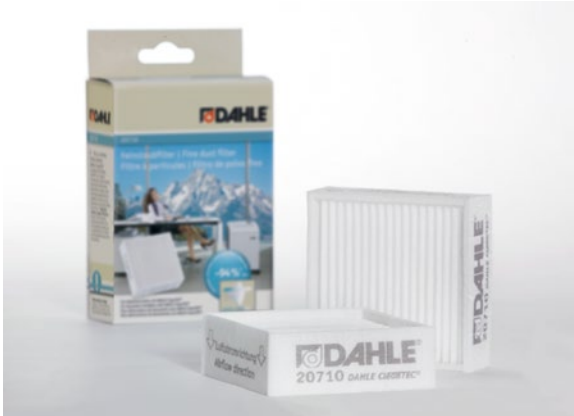
Fine particle filters Dahle 20710