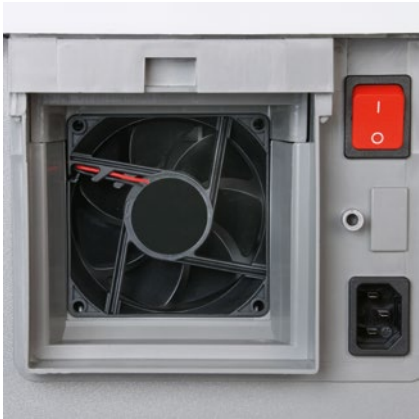
Powerful fan sucks in fine dust particles inside the document shredder and feeds them to the filter