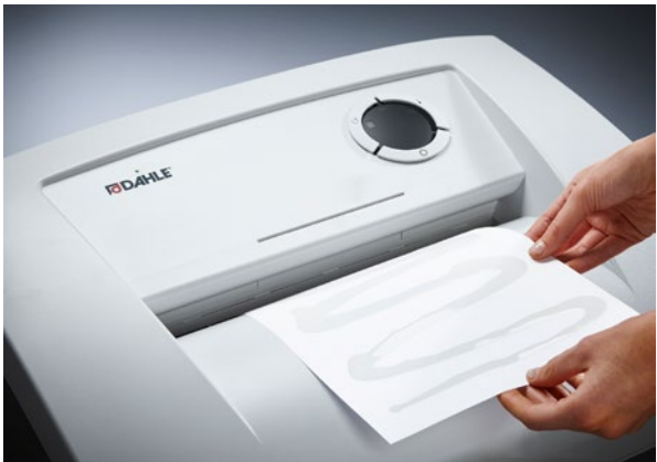
Dahle Waste 206air document shredder